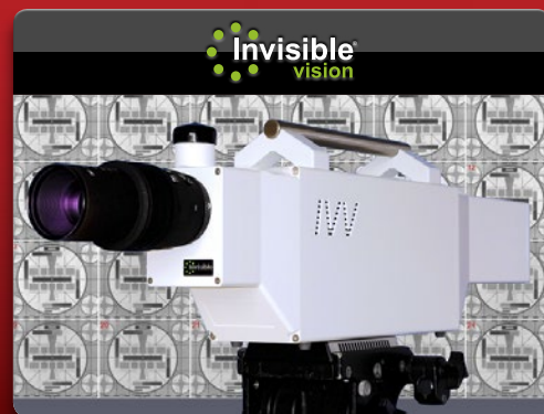
Invisible Vision UHSi 12/24 Ultra High Speed Framing Camera

Stop by booths 33/34 and see what we're talking about.