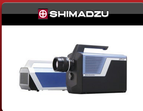
Shimadzu HyperVision HPV-X